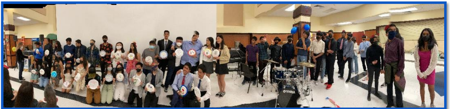
Graduating Class of '22