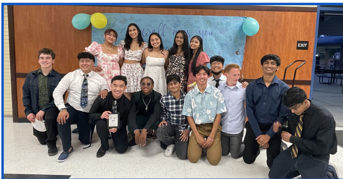
Tuesday, May 17, Choir Banquet