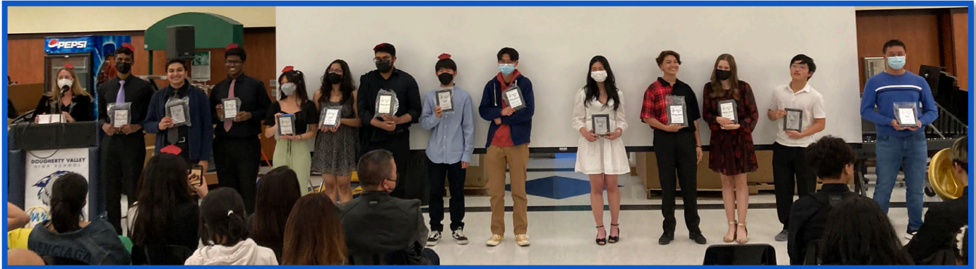
Class MVP and Director's Award Recipients